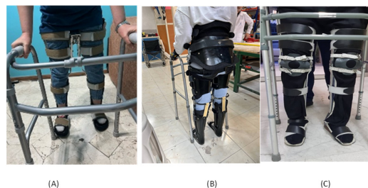
Figure 1. Orthoses Utilized in This Study, A) new MLRGO, B) IRGO, C) KAFO

Figure 2 illustrate the lightweight design, axis alignment (65 mm from the seat), and key components of the new MLRGO. Unlike the original MLRGO, the saddle-shaped seat was removed to enhance comfort. Components included a middle section for reciprocal propulsion, bearing covers, links to KAFOs, a locking mechanism, and cable structures.